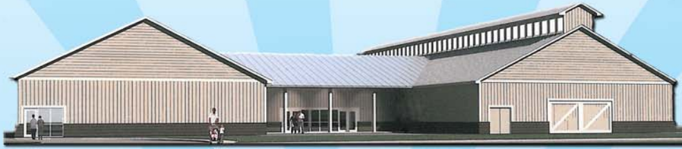
Architectural Rendering of the Proposed New Facility

The Butler County Agricultural Society (BCAS) is a non-profit organization that was founded in 1836. We are best known for our work in operating the Butler County Fair. In 1856, the BCAS purchased thirty-nine acres in Fairfield Township that would become the permanent home of the Butler County Fair. The BCAS and its annual fair remain as excellent examples of the strength of agriculture in Southwestern Ohio. Today's fair, with its games, rides, livestock exhibits and other attractions, encompasses the whole of both rural and urban cultures of the county.