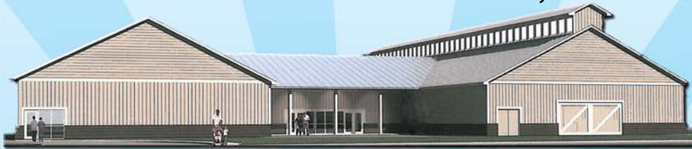
Architectural Rendering of the Proposed New Facility

The Butler County Agricultural Society (BCAS) is a non-profit organization that was founded in 1836. We are best known for our work in operating the Butler County Fair. In 1856, the BCAS purchased thirty-nine acres in Fairfield Township that would become the permanent home of the Butler County Fair. The BCAS and its annual fair remain as excellent examples of the strength of agriculture in Southwestern Ohio. Today's fair, with its games, rides, livestock exhibits and other attractions, encompasses the whole of both rural and urban cultures of the county.